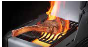
Infrared SIZZLE ZONE™ side burner