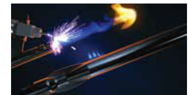
Instant JETFIRE™ ignition