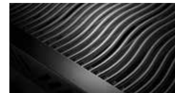
7.5 mm stainless steel Iconic WAVE™ cooking grids