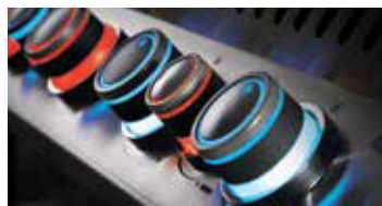
NIGHT LIGHT™ control knobs with SafetyGlow™