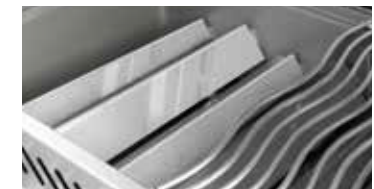
Dual-level stainless steel sear plates