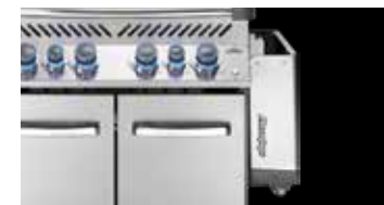
Folding side shelf